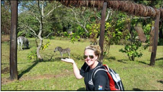
Cutest Zebra Ever! In Mlilwane