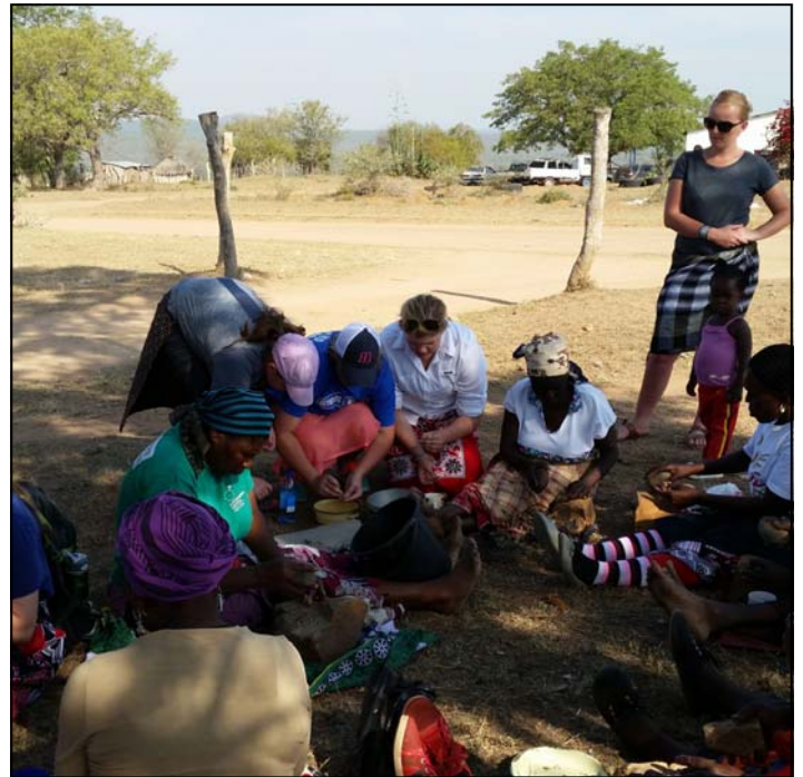
Processing marula kernels for cosmetics, rural Swaziland

The instructors' inquiry on students' cultural engagement, pre- and post-travel, was presented at the 2015 Symposium of the International Food and Agribusiness Management Association on June 15, 2015.