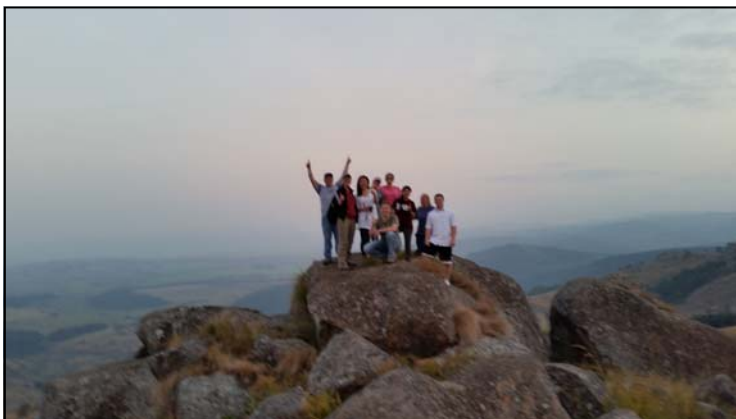
Rock of Execution / A Bit of a Scramble