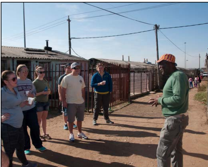
Learning about apartheid story, markets and community, Soweto