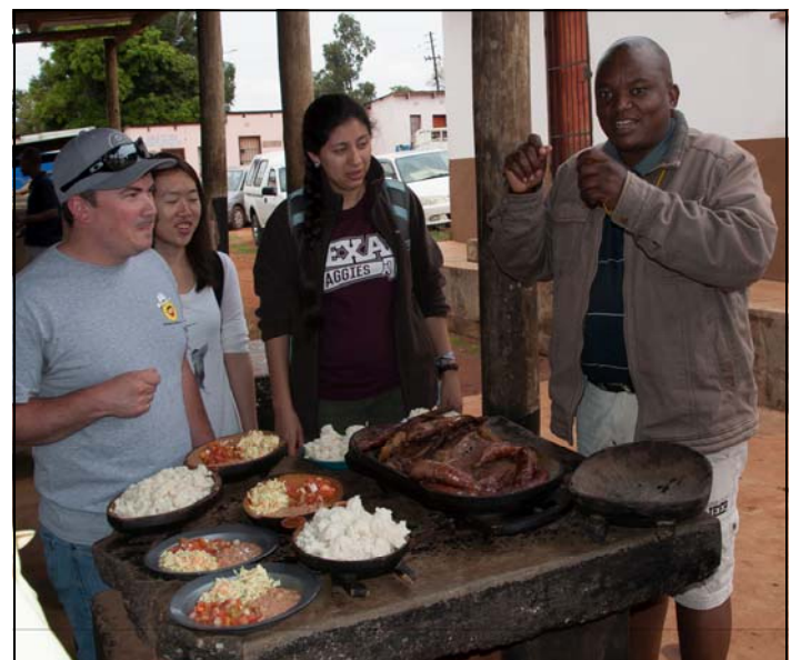
Traditional Swazi meal in Lobamba