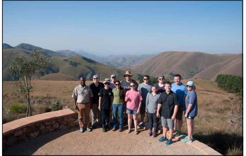
The Geo-Trail near Barberton, South Africa