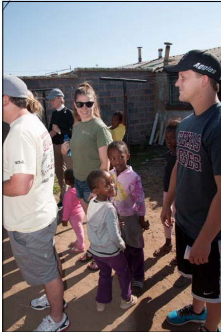
Making New Friends.