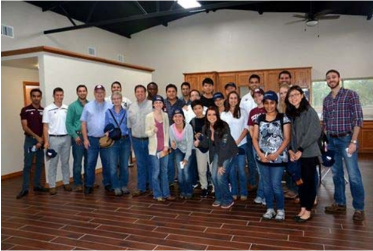
MAB students with leaders of Sexing Technologies

Twenty-five MAB students attended a field trip on November 4 to Sexing Technologies in Navasota and Producers Cooperative Association in Bryan.